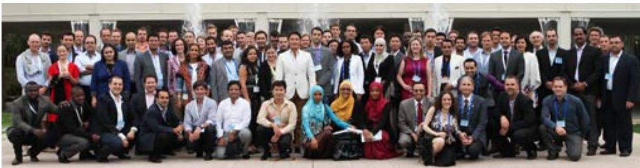
YP Delegates at the Barcelona YP Meet and Greet event

The 2013 YPMTP concluded at the Centenary Conference in Barcelona Spain. It was a special event, celebrating the past 100 years of engineering excellence.