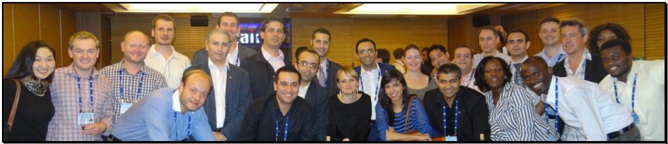
YP Delegates at the FIDIC 2012 Annual Conference